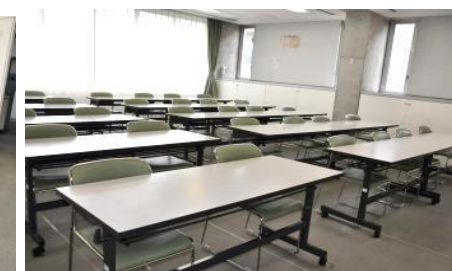
2nd meeting room (3F)

The 1st and 2nd meeting rooms can be used with the partition removed.