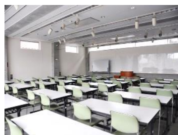
Multi-purpose hall (2F)

It can be used for a short meeting or a short break. (free)