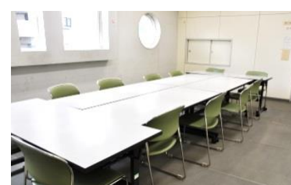
1st meeting room (3F)

It can be used for a variety of purposes such as dressing and child-rearing circles.