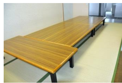
Japanese-style room (3F)

It can be used in lectures and multipurpose meeting rooms. There is also a screen, and a projector can be borrowed for free. In addition, since there is no soundproofing equipment, it can not be used when a loud volume such as a percussion instrument is emitted