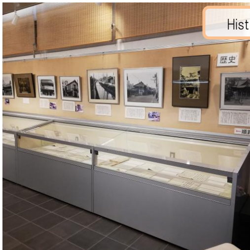
History around Ohyama Kaido